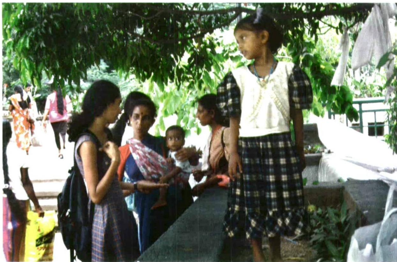
(Top) A gypsy woman reading palms (Bottom) Traders at the Park