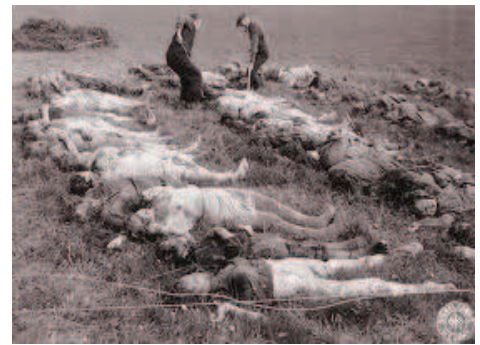
Multiple deaths in a mass disaster

Forensic Medical specialists (Judicial Medical Officers) along