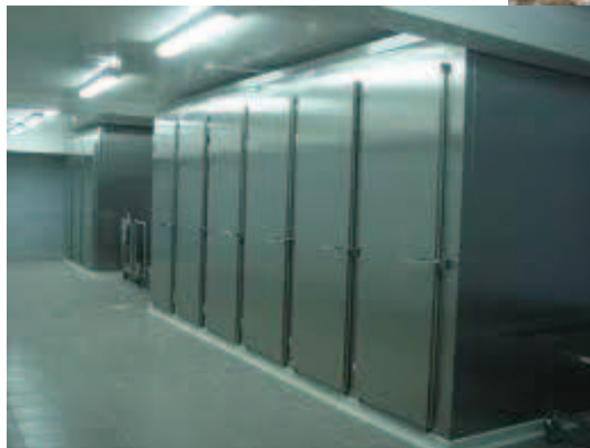
Refrigerators in a mortuary

When merely relating observations, doctors are ordinary witnesses; interpreting facts based on medical knowledge makes them expert witnesses, required to present their evidenced based scientific and independent opinion without bias toward the side that called them. In exercising medico legal duties conflicts between medicine and law and ethics can occur, usually over medical confidentiality and consent. Forensic medicine is one of the largest and most important areas of forensic science. In practical terms, a healthcare professional who works in the field of forensic medicine aims to discover the cause of a person's death, injury, or disease. It does so in the pursuit of societal justice. Healthcare professionals who specialize in forensic medicine serve extremely important roles that require a combination of precise scientific knowledge with