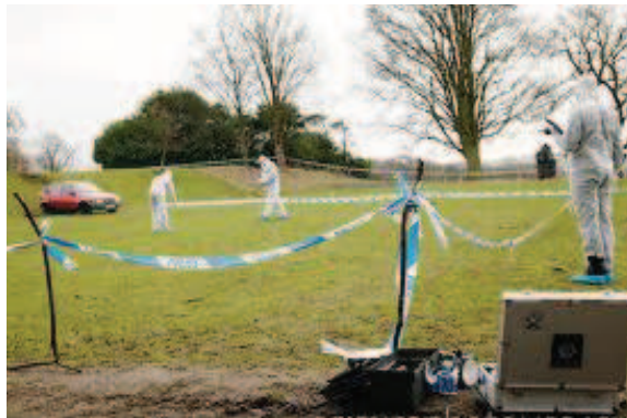
Cordon off scene of crime