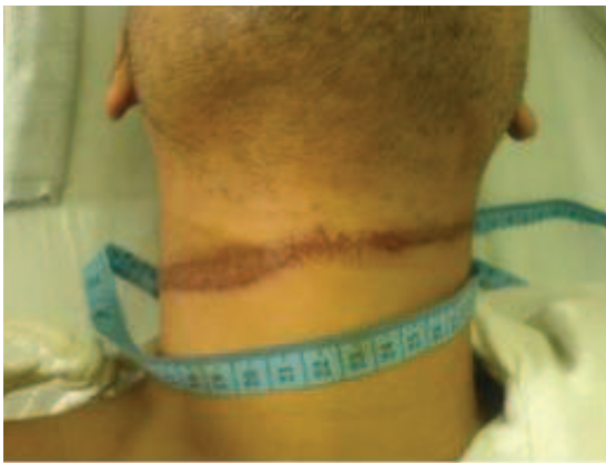
Ligature mark in the neck- Hanging

etc, number of shots, possible survival time and volitional activity, disability, its manner of infliction and whether the findings are consistent with the alleged incident. Courts tend to rely more on scientific evidence as they are independent and unbiased.