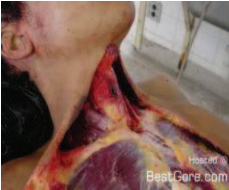
Autopsy- opening of neck & chest

dissection of the body. The post mortem examinations are done in a mortuary which must at least have basic facilities to do such an examination. Usually the deceased person has to be identified preferably by the next of kin.