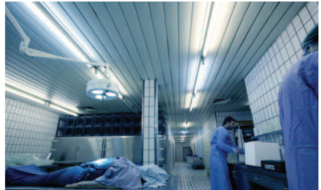
A modern mortuary

wound to head, exsanguinations, strangulation, etc.) and manner of death (homicide, murder, accident, natural, or suicide). Examination of wounds (injuries) caused by violence, accidents, self inflicted or negligence are done to determine, manner and time of causation and also to assess their seriousness and the possible effect on the body and the health of the injured. It also determines whether the injuries found in the