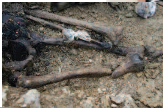
Partly burnt skeletal remains at a scene

of alleged victims of sexual offences, abused children, victims of torture and examination and reporting of persons for drunkenness and drug abusers. Perhaps more significant is medical testimony in court.