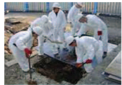
Exhumation by a team

with the other non specialist GMO provide the forensic medical services in Sri Lanka. Unlike in some other countries Judicial Medical Officers in Sri Lanka conduct clinical examination of living as well as the work of a Forensic Pathologist. They are considered as experts on medical matters in law suits. When interpreting wounds they are expected to give opinion regarding the nature of the injury such as abrasion, contusion, cut, stab, burns, gunshot, fracture etc and also to state whether it has been caused by a blunt weapon such as a club, rod etc or by a sharp weapon such as a knife, broken glass piece etc. In the case of a burnt person whether it was due to fire, heat, chemical (acid, alkaline etc.), and also whether it was self inflicted or done with possible criminal intent by another etc. In a fire arm injury, whether it was from a