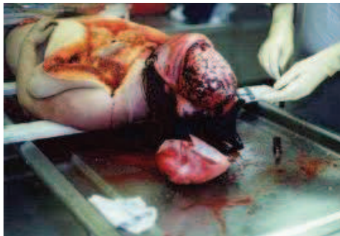
Opening of the skull at the autopsy

thyroid gland, parathyroid glands, oesophagus, heart, thoracic aorta and lungs to be removed. Following removal of the neck and chest organs, the abdominal organs are dissected en-mass or section by section. These include the intestines, liver, gallbladder and bile duct system, pancreas, spleen,