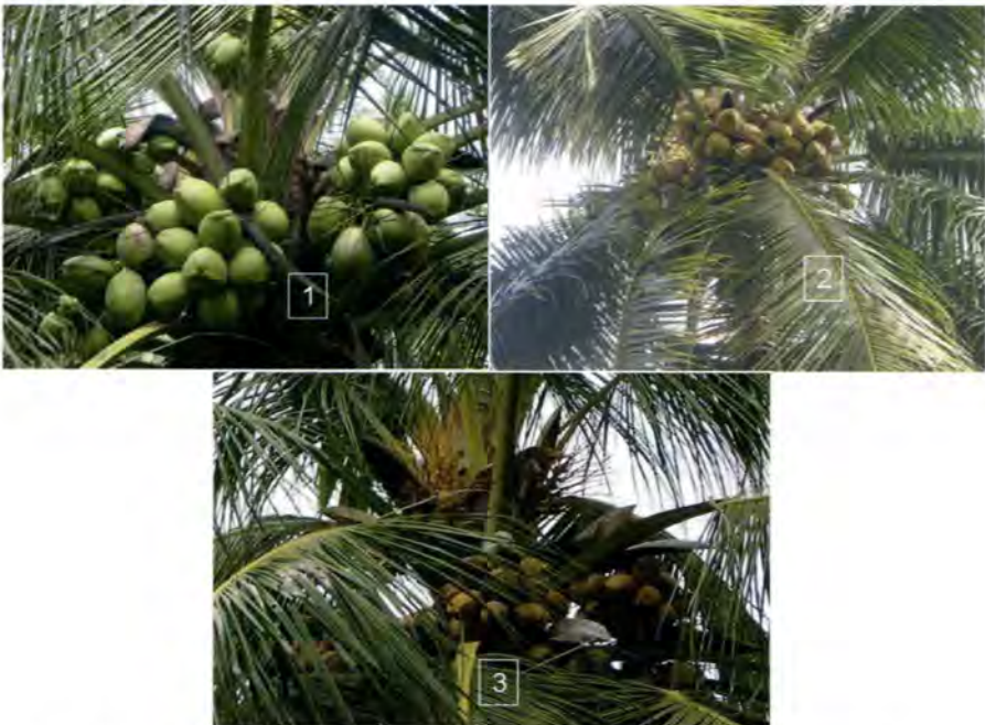
Fig. 1: Green (1), Intermediate (2) and Rathi (3) phenotypes of Sri Lanka Tall coconuts

The data gathered from ninety adult palms comprising thirty palms each of green, rathi and intermediate fruit colour based coconut phenotypes (Fig 1) planted at field No. 04 of the Isolated Coconut Seed Garden at Ambakelle were used for this study. Colour based discrete groups were selected considering clear variations and leaving out shades varying from each group to the next. The selected palms were all of the same age and were under similar management practices.