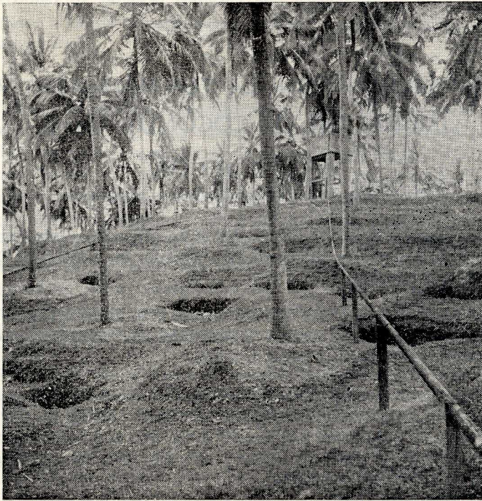
Plate I Water tank with pipe line