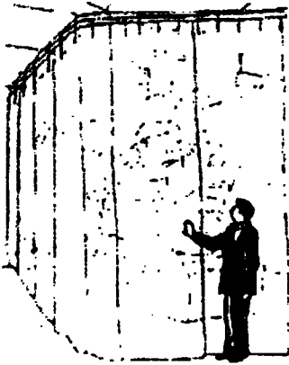
Figure 6. A typical sound curtain

Industrially sewn sound curtains provide an inexpensive, flexible approach to block and contain plant noise. The Sound Curtains are rugged and durable and are easily installed by ceiling or floor mounted hardware.