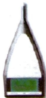
Figure 4. Typical picture of a sound level meter

Before and after each series of measurements, sound level meters should be properly calibrated using acoustic calibrator or pistonphone complying with class 2 of BS 7189 : 1989 (IEC 942) or complying with standards or by means of a measuring device recommended by a competent institute.