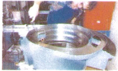
Figure 5. Application of a noise killer

Noise killer spray is being used as a spray-on sound and vibration controller (liquid sound deadening). It literally removes unwanted noise and vibrations by converting them into low-grade heat.