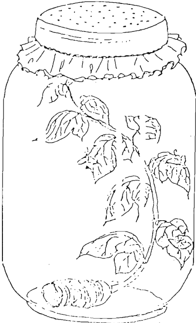
Figure 1 B