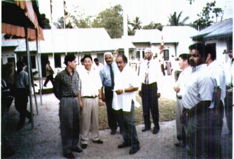
Niwanthipura Opening Ceremony

The Niwanthipura Project will seek to assist the Government of Sri Lanka to find an answer by including a research component so that not only will a neighbourhood be designed and constructed but the design assumptions and their implications will be decided over a number of years and the results made available.