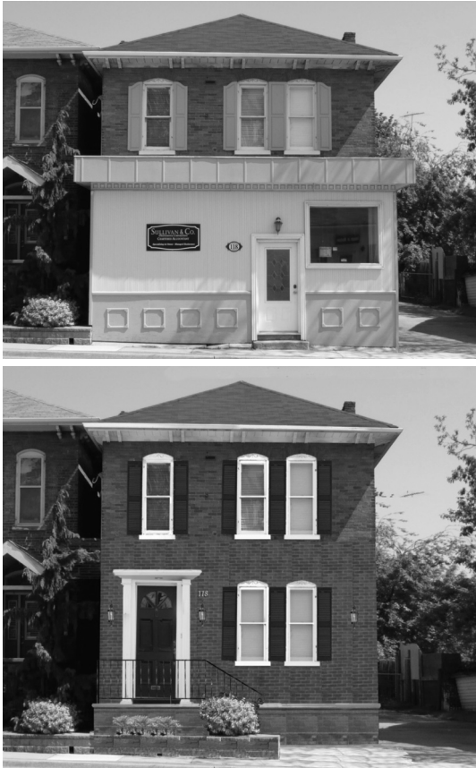
No 118, King Street. Existing situation of the building (above) and same with façade improvement (below) under the Grant Program, Photo Credit: Author