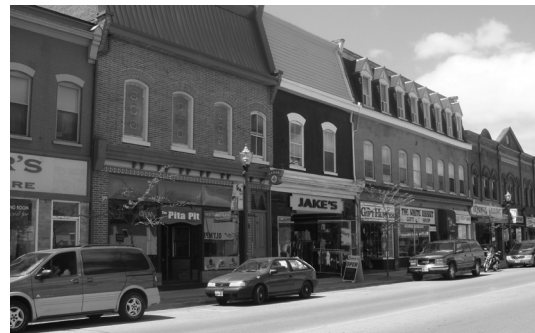
Historic town centre, Town of Clarington, Ontario

Like many sub-urban communities around Canada, the town centre of Clarington in Ontario is a traditional residential and commercial center. People visit the centre for banking, to shop for cloths, to eat in the restaurants or for doctors or hairdresser's appointments. There are no complicated activities, or large shopping malls or huge office complexes in the town centre.