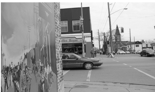
Clarington town centre murals, implemented under Public Art Program improve the town's historic authenticity, Photo Credit: Author

Town and the business community believed that the town's character improvement is important to attract shoppers and local and foreign visitors. A downtown wide public art program was implemented improving the neglected areas of the town, specially for vacant sites and uninteresting buildings façades. It is a culturally sensitive idea to install large murals depicting the history of the places with their original view of such places. A number community based organisations were involved with the Municipality in this program.