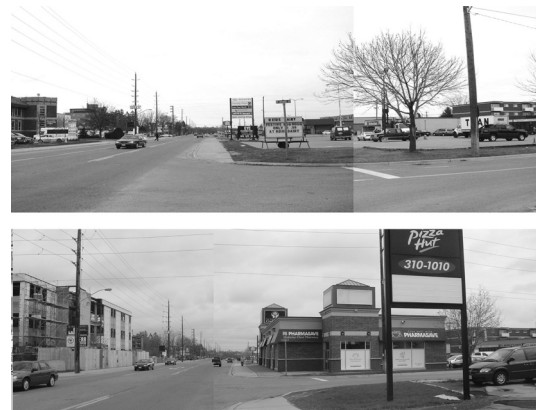
Clarington Downtown –The Urban Design efforts to bring the built edge to the King Street front. This Shopping block at the eastern edge of the downtown was constructed in 2006 as per the east town area urban design framework Plan.

The urban design played a key role in improving the street character of many areas, specially the east end of the centre where many buildings dating from 1950s are located far from the street while locating large car parks next to the street. King Street East Corridor Urban Design Study of 2004 (Planning Services Department, 2005) identified many community related issues with regard to the character and functionality of the area and its recommendations such as bringing the built edge to street and designs responding the street intersections and corners incorporated in granting the development approvals of all the projects along this area.