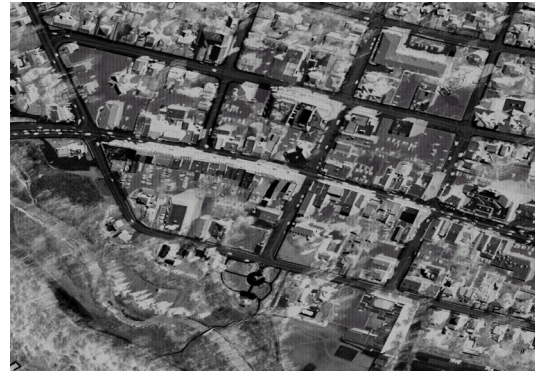
Identified areas for the creation of new parking and rear commercial streets in Historic Downtown

The town's public park with facilities such as raised stage, toilets, and a public gathering place with a shelter was built with landscaping features. This is widely used by the people of the community for various social events, music, dramas, meetings and festivals through the year.