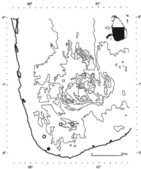
Figure 2. Distribution of Lankascincus greeri in southwestern Sri Lanka. (solid symbol indicates type locality).