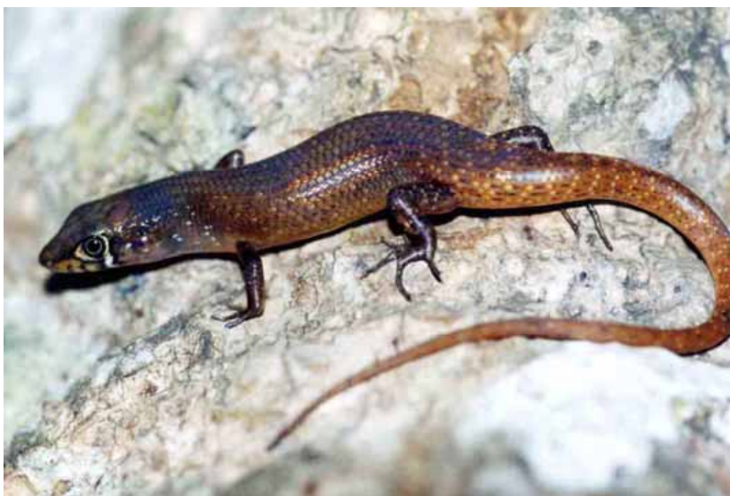
Plate 1. Holotype of Lankascincus greeri (male). WHT 6524, 52.0 mm SVL.