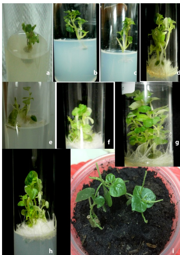
Figure 2: In vitro propagation from axillary node explants of Peperomia pellucida (L.) Kunth. (a) Multiple shoot initiation from axillary node explants on MS medium with 2.0 mg L -1 KIN after 6 weeks of culture, (b) Adventitious shoot regeneration on MS medium with 1.5 mg L -1 BA, (c) Shoot multiplication on MS medium with 2.0 mg L -1 and 0.5 mg L -1 NAA, (d) Root induction and proliferation on MS medium with 1.5 mg L -1 IAA, (e) Root proliferation and shoot development on MS medium with 1.5 mg L -1 IBA, (f) Adventitious shoot and root development on MS medium with 1.5 mg L -1 NAA, (g-h) Maximum shoot and root development from axillary node explants; (i) Acclimatized plants with ex vitro flowering from axillary node explants after 3 months.

On the other hand, BA alone, BA combine with NAA, KIN combine with NAA concentration induced the multiple shoots after 12 weeks of culture (Table 2; Figure c- e). The present study indicates that axillary nodes produce taller shoots. Other physiological disorder commonly observed in in vitro cultures affecting a wide range of plants depends