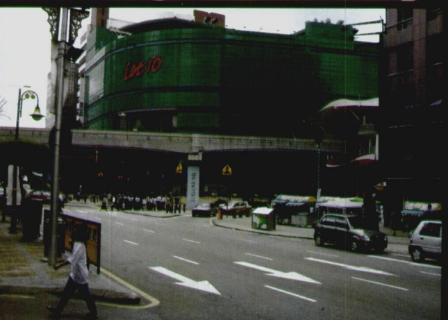
preserving the old facade and building the new structure behind it .