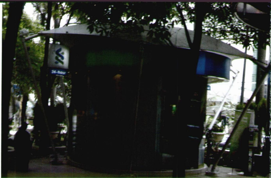
Tele-banking is a familiar sight.

we really did not need all that walk way. We needed to give it a bit of life to give it interest and by providing top cafeterias, bars, bank facilities we could make people use the facilities.