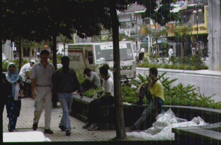
Tree lined pedestrian walkways