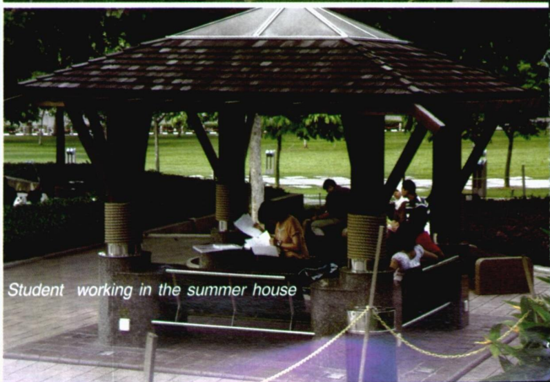
Student working in the summer house