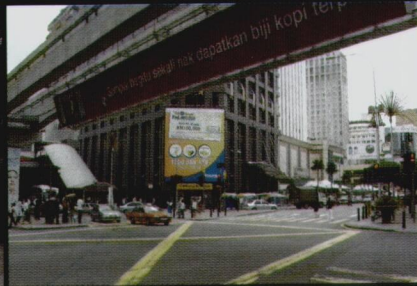
monorail link - advertisements - and moveable stalls