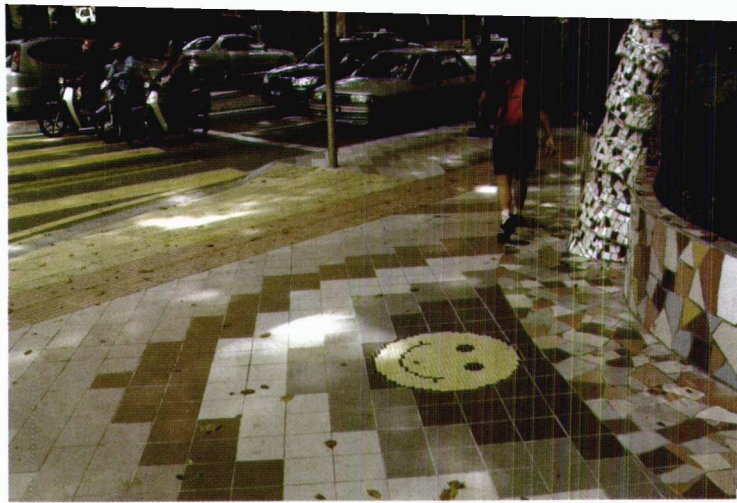
a pavement with a smiling face

A detail of a very long bus stand outside the JW Marriott Which merges with the rest of the shopping complex along Bukit Bintang Road. It has a canopy structure to create the main porch and to protect the 5 foot ways of the pedestrian walkway with their required shelter.