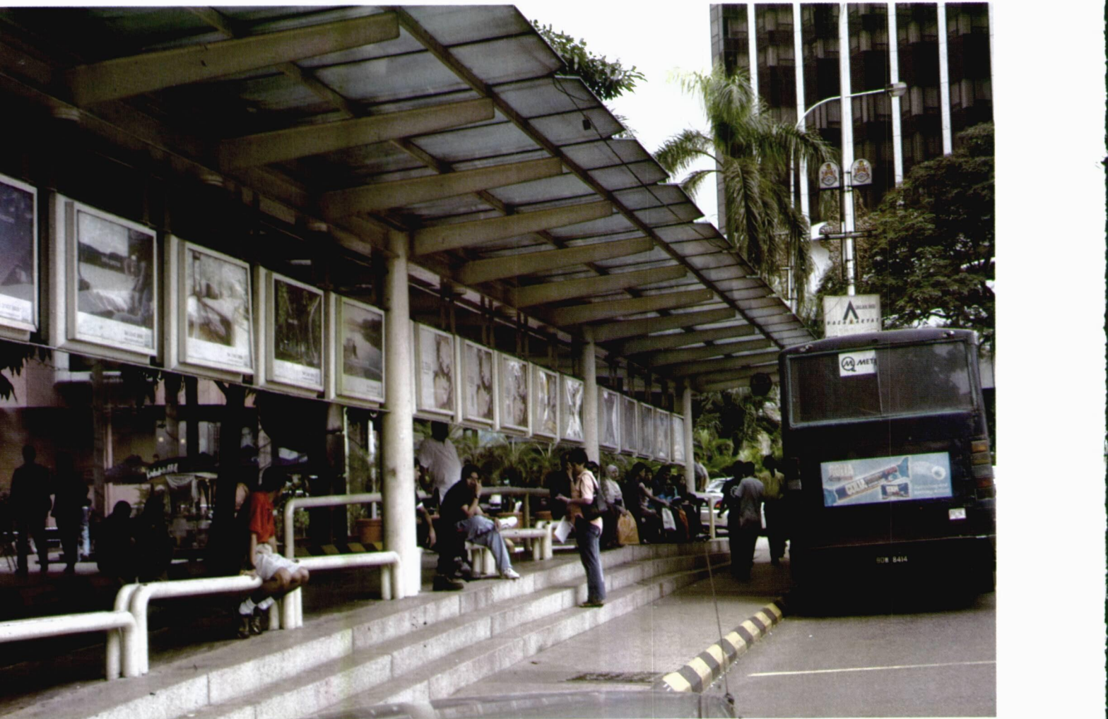
a very long bus stand outside the JW Marriott which merges with the rest of the shopping complex