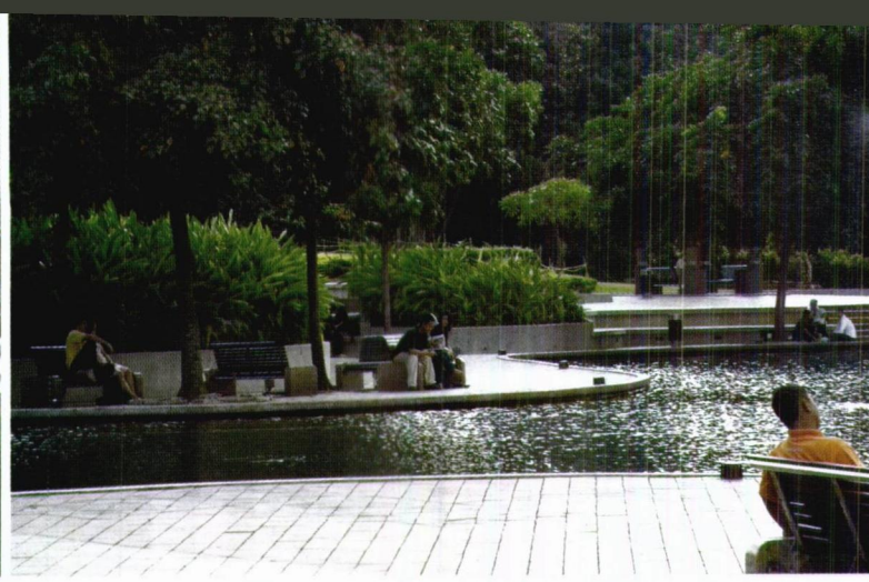
pedestrian walkways and parks with water bodies

An 'Interstice' is basically something that grows between two built forms. It is defined in the dictionary as a gap or chink between two rocks or solid forms. If you go out into your garden or along the road, the plant or the line forms the growth in between rocks - these are interstices. So, it is the line forms that are in plenty that can make the spaces happen if you really look at it - if you really gave it some thought.