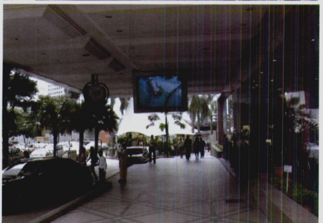
outdoor spaces in the city of Kuala Lumpur