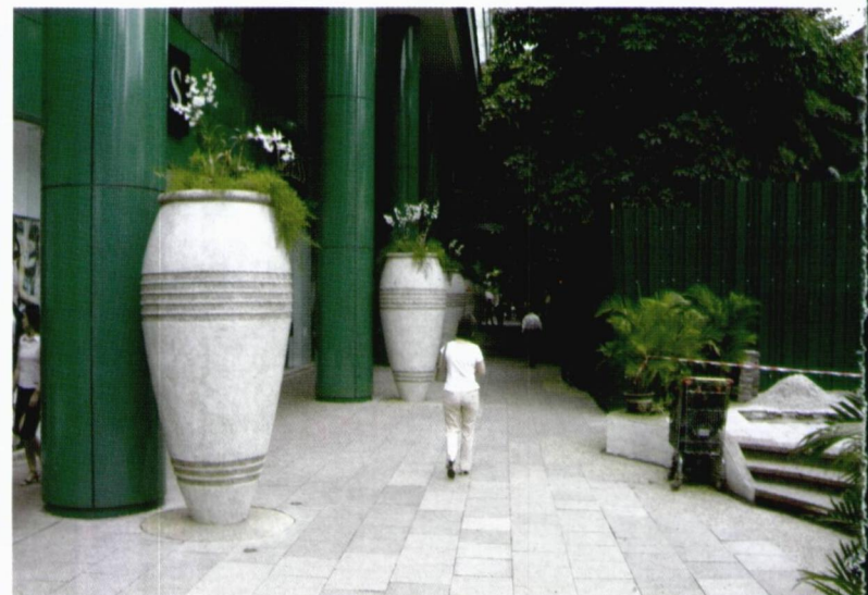
giant pots with orchids

Now with the introduction of these pedestrian walkways some of the shops have also taken that interesting elevation. - That is you do not go into the shop at ground level. You either go down to the concourse level or you go up to a mezzanine level and then the ground level of the shop is set back and give a sort of a tree level entrance.