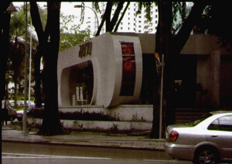
Details of ramps, walkway and tree lined avenues

Tourists both foreign and Malaysian are an every day setting Tourism Malaysia has allowed for the local industry, the local art industry to set up little stalls which at one point of time were not allowed. They required proper license. But of course even here they do have a license, but these stalls are movable. So you just wheel them away when you do not require them or they become a nuisance. Kuala Lumpur has an area identified as the 'golden triangle' The road through the golden triangle is a major street known as Jalan Sultan Ismail. Several major hotels are located here. The Shangri – la, the Concorde, the Equatorial, the Mutiara and Istana are along this road.