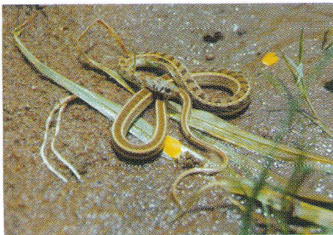
Figure 1: Amphiesma stolata (Buff-striped Keelback)

The growth of weeds in the rice field proper and the surrounding bunds adds another dimension to this ecosystem that is dominated by the monocrop. Weeds, graminaceous and broad leaved abound the rice fields and provide a refuge to the rice pests and natural enemies as they move from the rice plant to the weeds. A total of