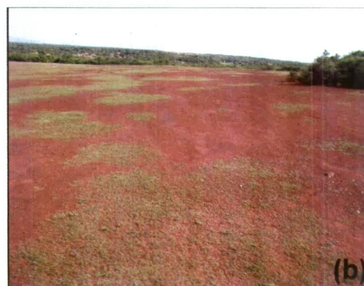
Figure 1: (a) Satellite image (downloaded from Google Earth) showing the Ussangoda serpentine deposit. The white broken line demarcates the boundary of the deposit. Numbers indicate the locations from which the samples of serpentine were collected. (b) Photograph showing the red soil overlaying the deposit.