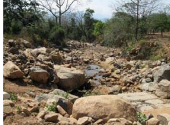
Figure 3: Debris-flow/landslide coming down the hills near Minipe and flowing towards the Victoria Reservoir (beyond the trees). There are 14 such flows cutting across the main road (top right corner) within a 10 km stretch. Note the size of the boulders.

Water is the least regulated, most profligately exploited and cheapest natural resource. With current per capita water availability of \sim 2492 \text{ m}^3 per capita per year, Sri Lanka does not face a severe water crisis at present. However, the likelihood of water scarcities in the future, especially at six district levels is a cause for concern. Population growth, rising living standards and per capita incomes, poverty alleviation and improved quality of life and changing life styles are all reflected in increased per capita water use. With a projected population of > 25 million by 2030 and the likelihood of climate changes, water availability for irrigation, agriculture and food production and domestic use could drop well below the recommended 50 litres/capita/day and with severe consequences for water security 22 .