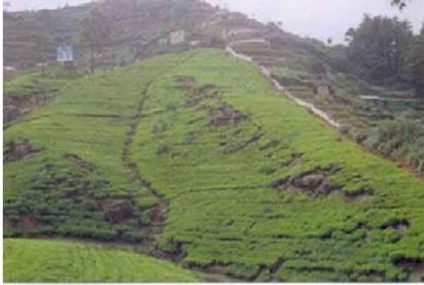
Figure 2: A landslide revegetated with tea (left) and terraced vegetable plots (right).