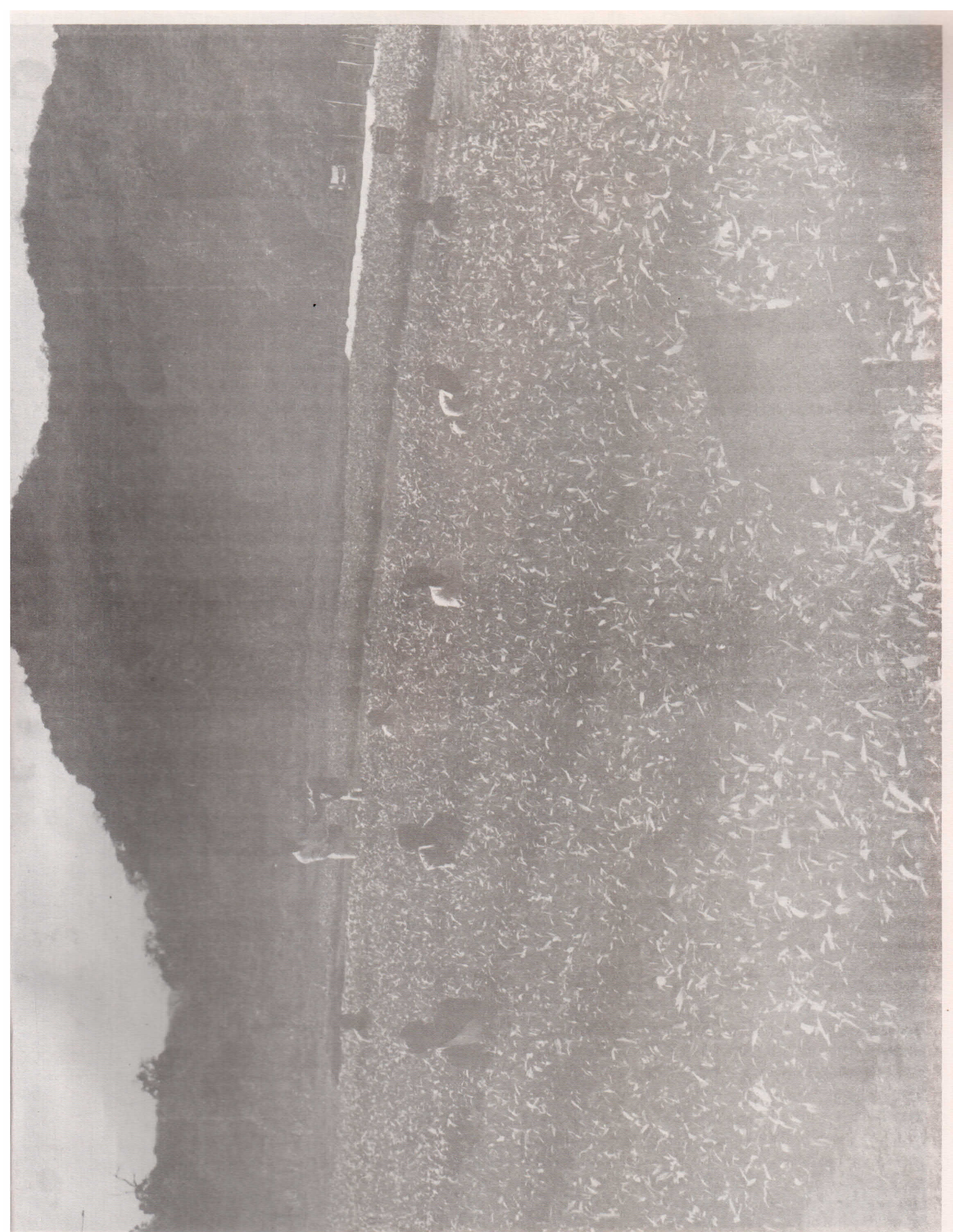
Ceylon Tobacco Company plant nursery at Naula.