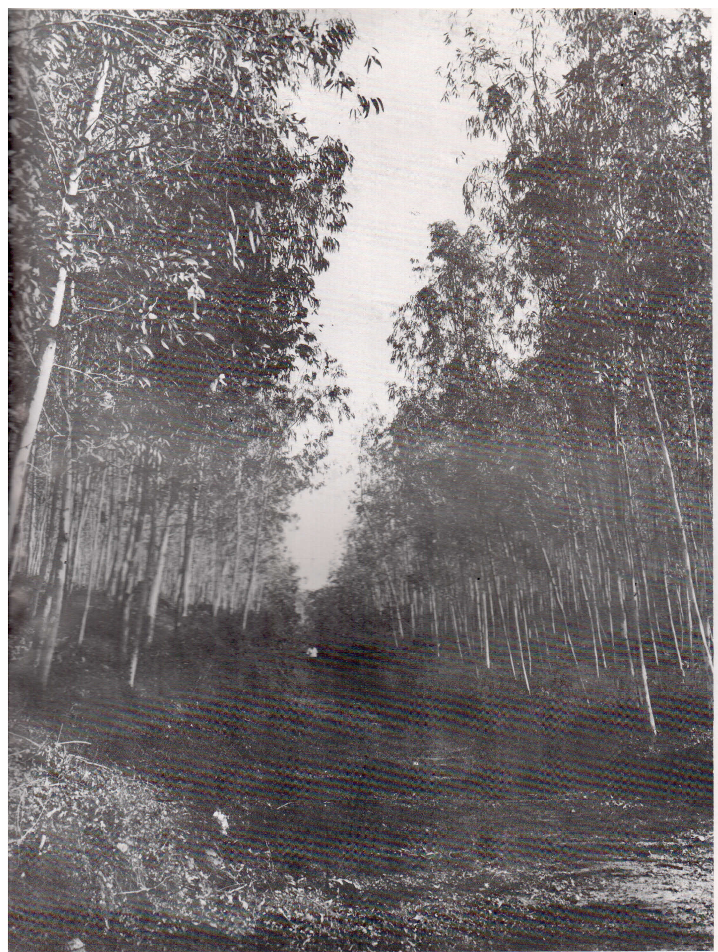
Ceylon Tobacco Company fuelwood plantation at Naula..