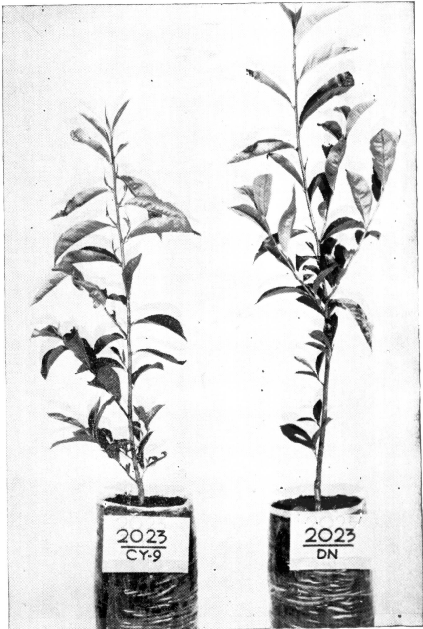
Fig. 2. — Two - year - old grafted plants 2023/DN and 2023/CY-9. Note that both at 9 months and two years plants 2023/DN had a better shoot growth than plants 2023/CY-9.