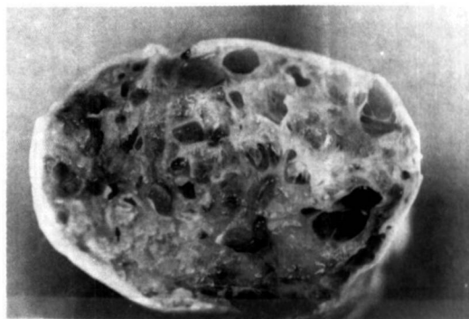
Fig. 1. Solid, cystic and oedematous cut surface of the tumour.

The macroscopy specimen consisted of an encapsulated tumour measuring 6 x 4 x 3 cm with adherent fallopian tube. There was no identifiable normal ovarian tissue. The cut surface appeared variegated with oedematous, mucoid, cystic and solid white areas.