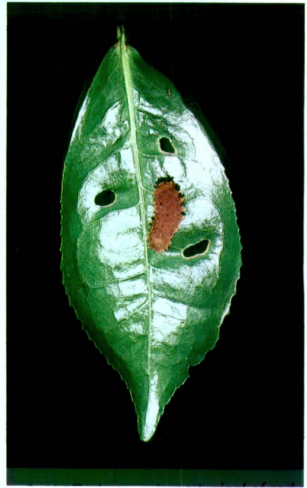
Fig. 3 – Early symptoms typical of red-slug, psychid and geometrid feeding