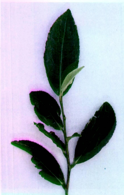
Fig. 4 – Sewing blight