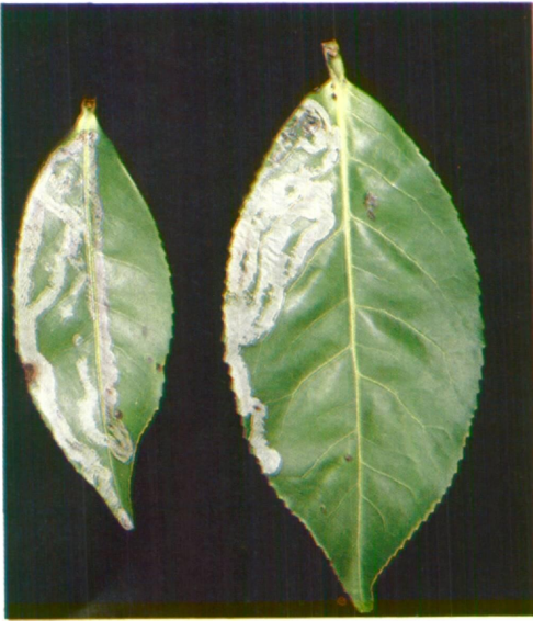
Fig. 12 – Damage symptoms of Tea Leaf Miner