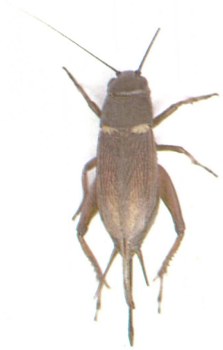
Fig. 13 – Tea Cricket