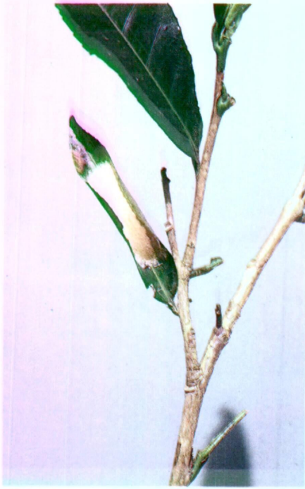
Fig. 8 – Pupal case of Red slug inside a leaf-fold