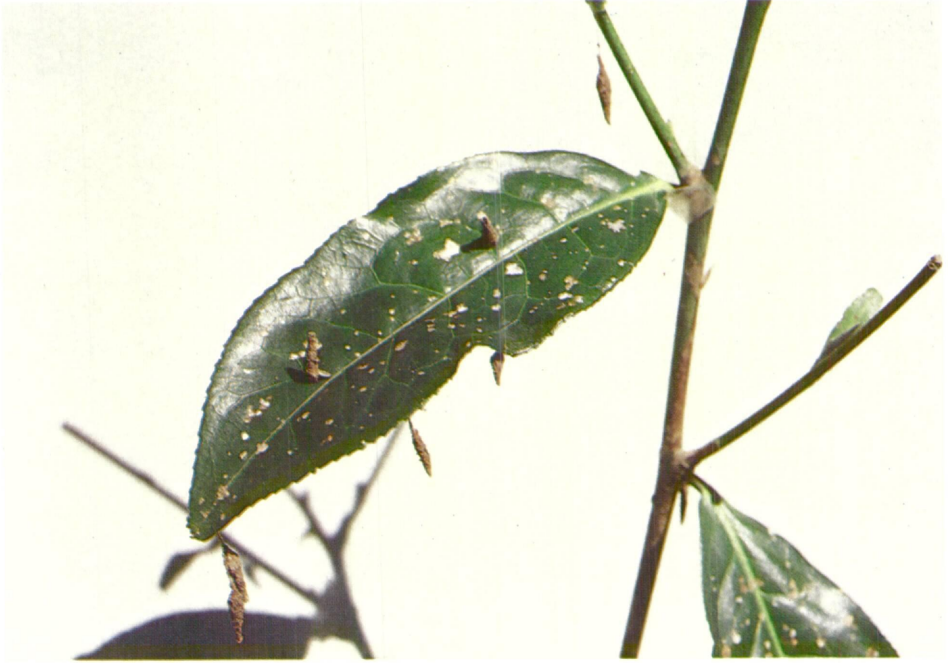
Fig. 11 – Bag worm larvae and pupae (hanging down on threads)