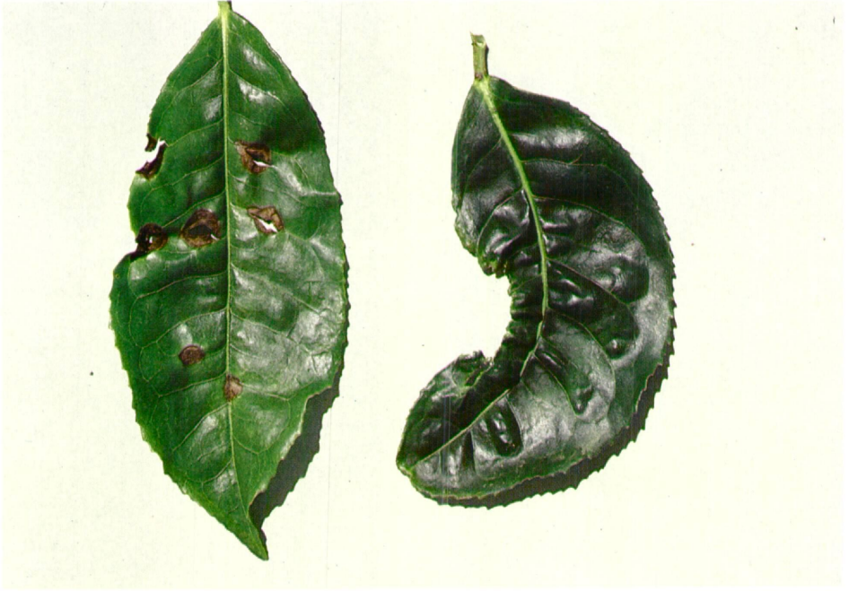
Fig. 6 – Damage symptoms of Tea mosquito bug (left)