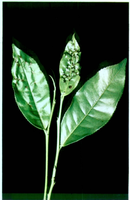
Fig. 5 – "Corroded flush" of Lygus bug