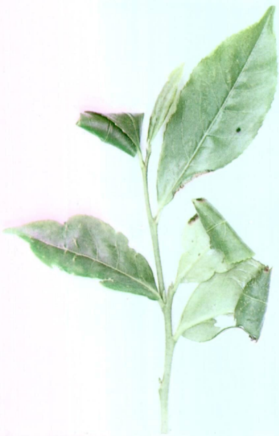
Fig. 2 – Marginal leaf-roll of 1st instar and leaf-nests of older instars of tea leaf roller larva