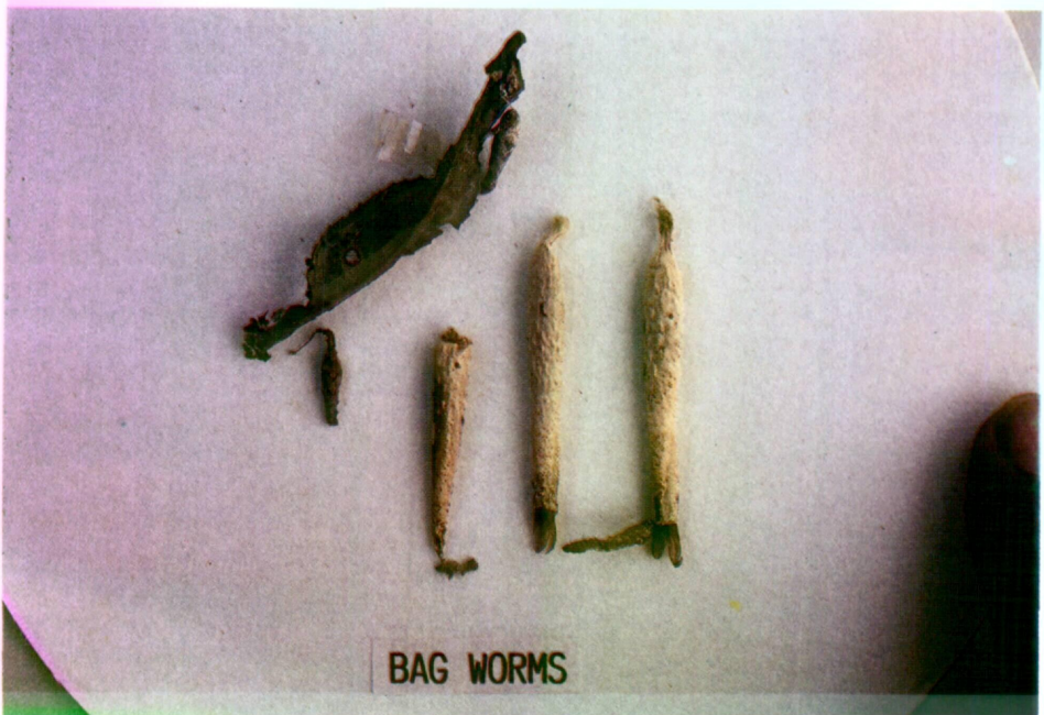
Fig. 10 – Bag worms of different species