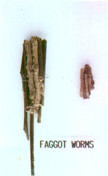
Fig. 9 – Faggot worms of different species