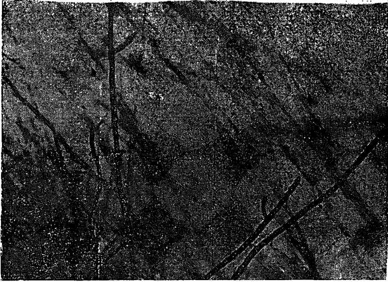
Fig 3. Trichoderma sp. grown in paired culture with R. lignosus on an agar coated slide. Note the darkly stained hyphae of Trichoderma sp. and the disintegrating hyphae of R. lignosus .