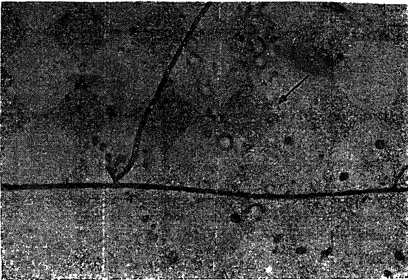
Fig 4. Penicillium sp. grown in paired culture with R. lignosus on an agar coated slide. Note the darkly stained hyphae of Penicillium sp. and lysis of R. lignosus hyphae (arrowed)