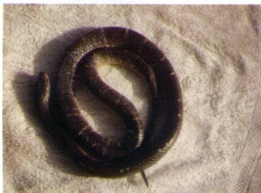
Figure 1 : Common krait ( Bangarus caeruleus ). This specimen was 105 cm long.

mate provide an ideal habitat for snakes (1,2). Common victims of Bangarus caeruleus are farmers who live in open wattle-and-daub houses and farmers sleeping in watch huts in agricultural fields. A significant number of patients die before reaching a hospital. Surveys carried out in 1983 in Anuradhapura district (1,5) have shown that Bangarus caeruleus bites accounted for 45% of 110 deaths in the field due to snake bites. However, in recent years more patients have sought the life saving benefits of hospital treatment. The aim of the study was to gain a proper understanding of the clinical and epidemiological aspects of common krait bites and to develop a policy of management in the intensive care setup, based on the prospective observations.