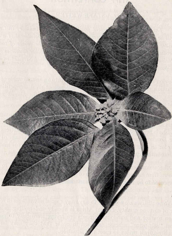
Plate VIII — Euphorbia geniculata .