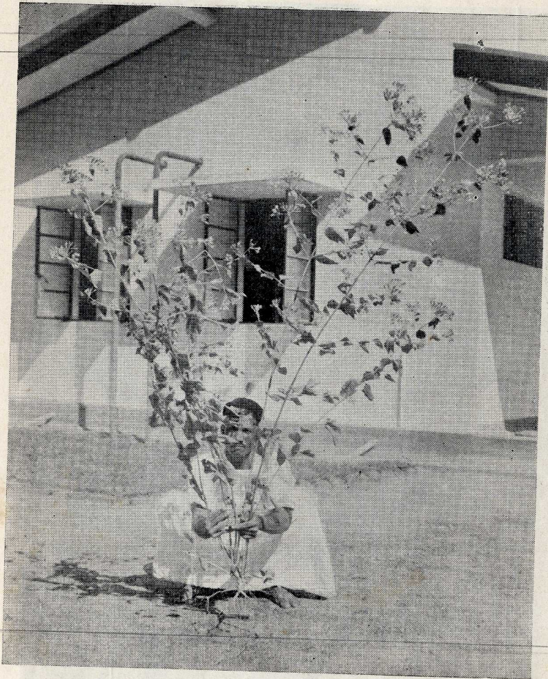
Plate VI — Eupatorium Odoratum