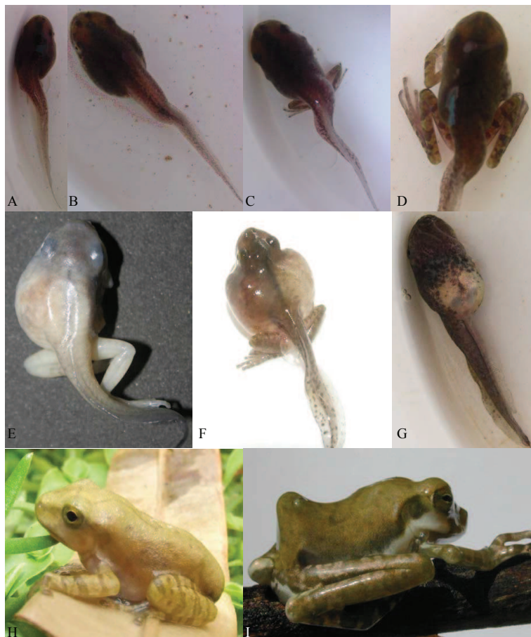
Figure 2: Different stages of representative malformed tadpoles of Polypedates cruciger exposed to monostome cercariae. A to D - tadpoles with kyphosis (hunched back), E & F - tadpoles with edema and G - a tadpole with an ulcer. H - a normal metamorph and I - a malformed metamorph with kyphosis.