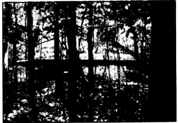
Figure 3: Ritigala Ancient Monastery

criteria used for determining terrestrial bio-regions are, degree of threat, population density, development pressure, biodiversity based on available data, economic potential based on road network, forest coverage and watershed value. Fifteen terrestrial and coastal bio-regions were