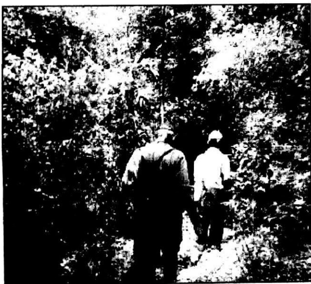
Figure 4: Trekking in Sinharaja rain forest

Sri Lanka still focuses on nature tourism rather than ecotourism. Ecotourism is the most appropriate type of tourism in Sri Lanka, where six sites have been designated as World Heritage Sites by UNESCO (United Nations Educational, Social and Cultural Organisation) Sri Lanka offers diverse opportunities for nature lovers to widen their experience through wildlife safaris, bird watching, hiking, trekking (Figure 4), photography, cycling, and many more. An ecotourism model for Sri Lanka should be formulated