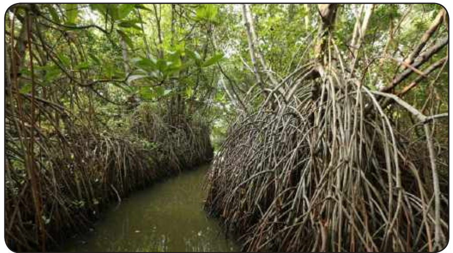
Fig 5 : Mangroves in Sri Lanka

controlled conditions. Raw organic materials such as crop residues, animal wastes, green manures, aquatic plants, industrial wastes, city wastes, food garbage etc. enhance their suitability for application to the soil as a fertilizing resource, after composting.