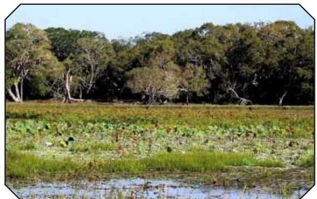
Fig 4 : Wet Villu ecosystem in Sri Lanka