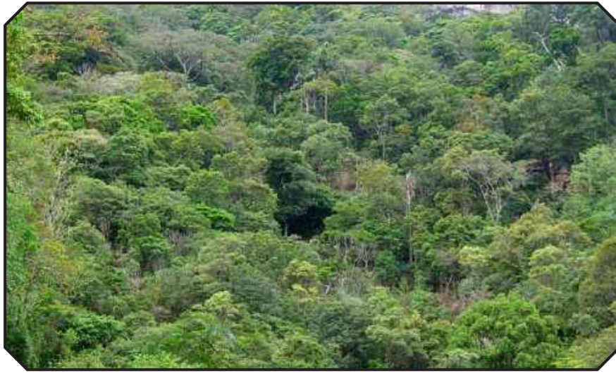
Fig 3 : Tropical rainforest – Sinharaja in Sri Lanka

of these resources, as well as the maintenance of their environmental functions.