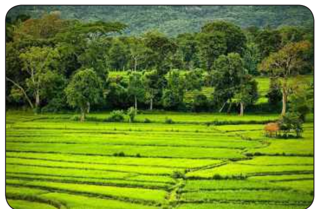
Fig 6 : Paddy ecosystem in Sri Lanka