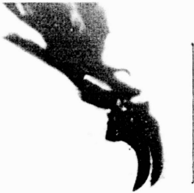
Fig. 3: Cephaloskeleton of the 3 rd instar larva of "Tumbu fly", Bar = 500µm

The cephaloskeleton was dissected and this and the posterior spiracles were mounted in Depex after standard fixing, dehydration and clearing procedures. The labial sclerites of the cephaloskeleton are long and curved (Fig. 3). The peritreme of the posterior spiracles is only faintly sclerotised and the slits slightly sinuous giving it a question mark (?) appearance while the button is indistinct. The larva was identified as a 3 rd instar larva of C. anthropophaga .