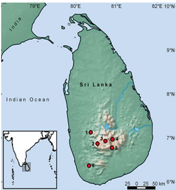
Figure 1: Location map of the study area

The abundance of nocturnal insects were high in tea plantations of Sri Lanka throughout the year. Insectivorous bat species were also recorded from all the study sites. Most of the tea pests are considered seasonal pests, it is a very good possibility to use generalist predators as effective biocontrol agents in tea pest control because generalist predators can be sustained