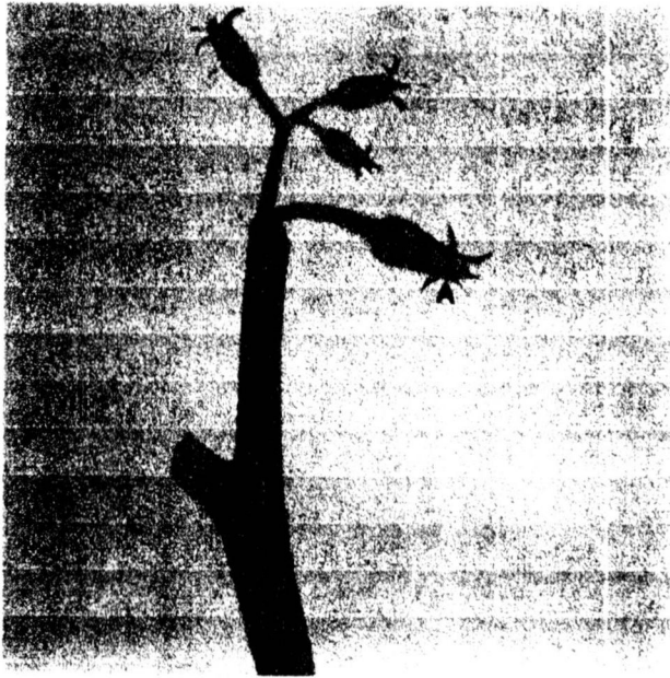
Fig. 1. Four-flowered inflorescence of eggplant. A, first flower bud with strong pedicel in a solitary position

were below anther tips, showing no variability between accessions except in 02270, which had stigmas more extended than anther tips, in both first flower and cluster flowers. Also, stigmas of cluster flowers were very rudimentary compared to the stigma of first flower except in accession 02270. Fig. 2 shows the variability for stigma position.