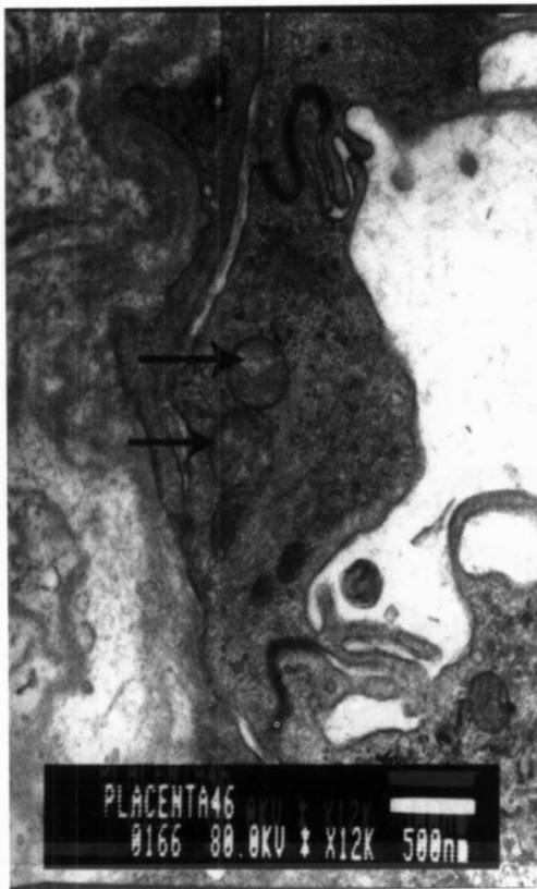
Figure 1. Electron micrograph of a terminal chorionic villous capillary of a placenta of a non-hypertensive mother showing an endothelial cell with normal mitochondria indicated by arrows ( \times 25,000 ).

The preservation of mitochondrial structure of the endothelial cells indicated that the quality of fixation was good. The section thickness was in the silver/gold color interference range. There was a preponderance of organelles around the nuclear region. In most of the terminal capillaries of placentae of hypertensive mothers, the endothelial cell thickness was increased. It was also observed that the number of mitochondria and rough endoplasmic reticulum in those endothelial cells were increased. Mitochondrial vacuolation and distorted mitochondrial architecture were noted in some endothelial cells of capillaries of placentae of hypertensive mothers (Figures 1, 2).