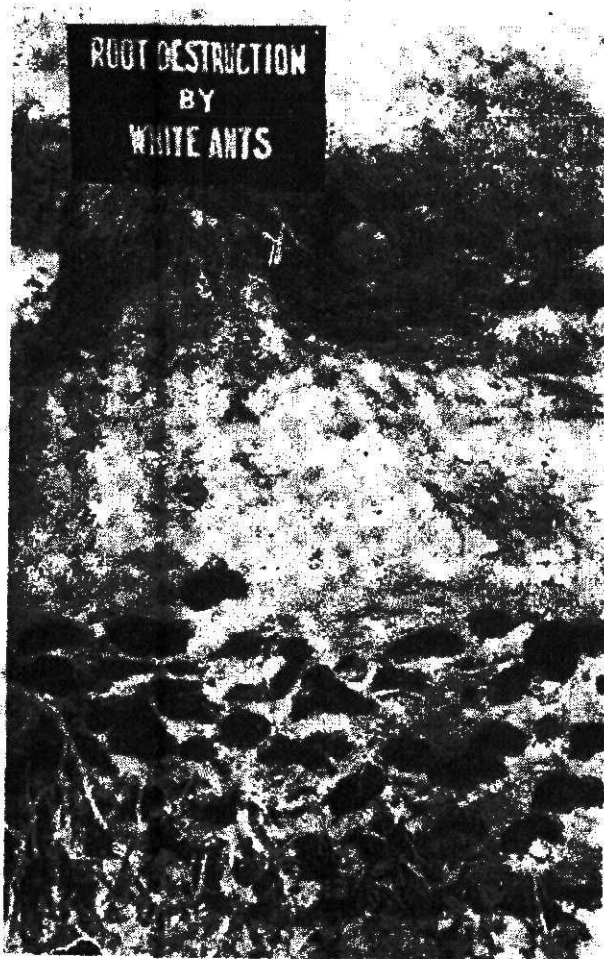
The root system of a coconut palm.

Tapering and Termites. —The destructive possibilities of white ants and the avidity with which they attack woody tissue are only too well-known. It is not so generally appreciated that soils can be profoundly modified from their original condition and that a