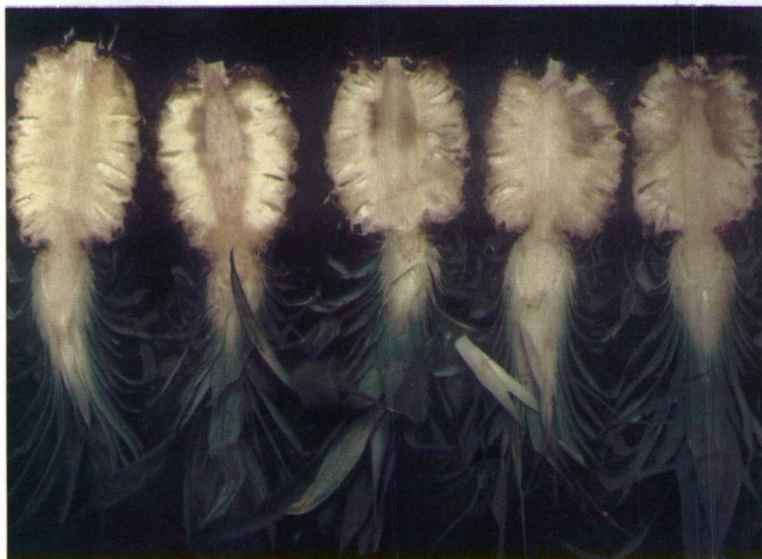
Figure 2. The development of internal browning symptoms in cv. Kew during cold storage (From left to right: Fruit 1 - 7 d of cold storage with no visible symptoms; Fruit 2 - 14 d after cold storage showing brown, water-soaked patches in the flesh and in the core; Fruit 3, 4 - 18 d after cold storage with brown, water-soaked patches in the flesh and the core; Fruit 5 - 21 d after cold storage with larger, brown colour, water-soaked areas in core and the flesh tissue)