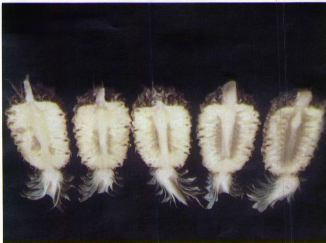
Figure 1. The development of internal browning symptoms in cv. Mauritius during cold storage (From left to right: Fruit 1 - 7 d after cold storage with translucent patches; Fruit 2 - 10 d after cold storage with translucent patches spread into the periphery of the core region; Fruit 3, 4 - 14 - 18 d after cold storage with brown water-soaked areas in the periphery of the core region; Fruit 5 - 21 d after cold storage with brown water-soaked areas in both the core and flesh tissue)