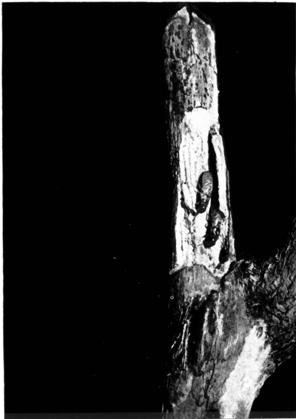
Fig. 1. — Dealate imagos of Glytotermes dilatatus initiating new gallery in pruning snag.