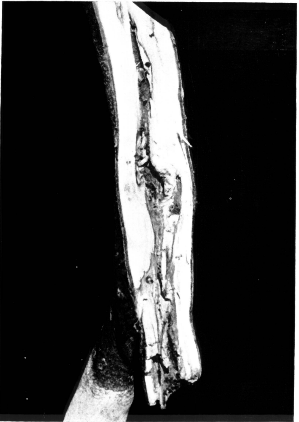
Fig. 2. —Young colony of Glyptotermes dilatatus in gallery that has progressed into sound wood via rotted snag.