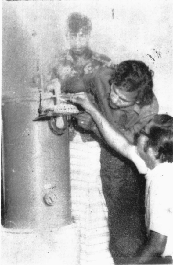
Above a biogas powered lamp being tested out at Pattiyaapola; and below a 100 percent biogas powered 50 H.P. — 315 KVA 3 phase A/C unit in operation at the same place.