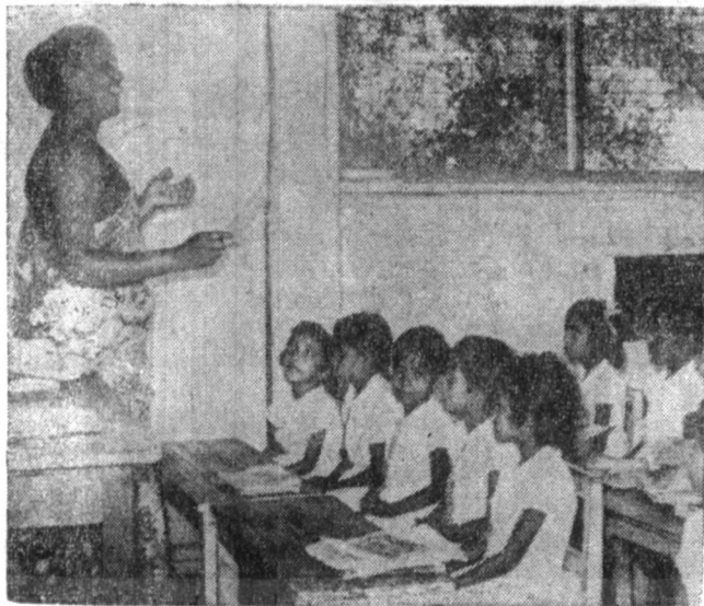
The Old Order — Learning is mechanical—rote learning, memorising and neat writing. The curriculum revolves round the 3-Rs. Children must sit in neatly arranged rows facing the teacher's table placed upon a platform.